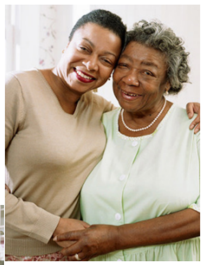
DATE AND TIME: February 26-28, 2024

The Wilson Caregiver College will focus on topics that provide critical information about Alzheimer's disease, caregiving coping strategies and approaches for seeking community based resources. Free parking and meals will be provided.